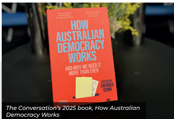
The Conversation's 2025 book, How Australian Democracy Works

Further, declining trust in institutions presents an opportunity for political leaders to demonstrate they are serious about protecting the public sphere against corruption and special interests. Advocates making the case to voters that misinformation campaigns are tied to the economic interests of extraordinarily wealthy individuals and corporations may be well placed to gain electoral support for regulatory measures.