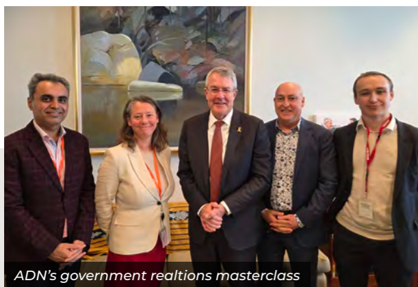
ADN's government relations masterclass

In this volatile context, with concern about violence and declining social cohesion, governments across the country have been curtailing protest rights in the name of avoiding inflamed tensions. These dynamics are being watched closely by our grant partners, who are needing to tread a careful balance of acknowledging the risks of the moment, while holding the line against attempts to wind back the speech and protest rights that are essential to a resilient democracy.