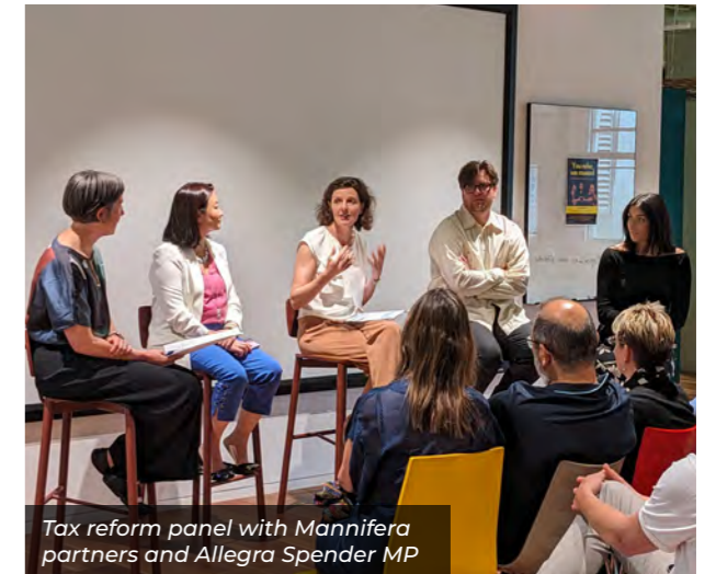
Tax reform panel with Mannifera partners and Allegra Spender MP

The advent of a strong ALP majority in the House of Representatives has opened up a political window for meaningful economic reform. Coupled with the Treasurer's personal interest in spearheading long overdue action on tax policy, there is a sense that there may be sufficient political capital to tackle big reforms. However, the Prime Minister is said to favour a more cautious approach to tax reform, being wary of 'scare campaigns' from the Opposition and well-resourced interests. This highlights the important role civil society advocacy will play in building the political support for change, and demonstrating to decision makers that there is political opportunity in spearheading reform.