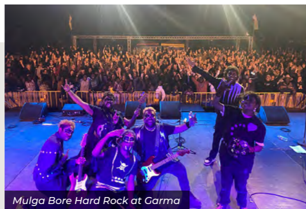
Mulga Bore Hard Rock at Garma