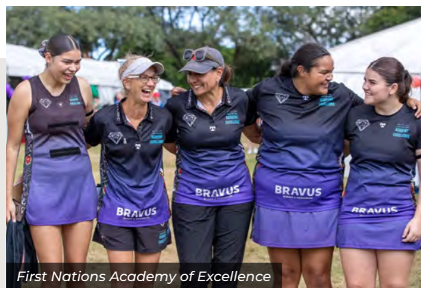
First Nations Academy of Excellence