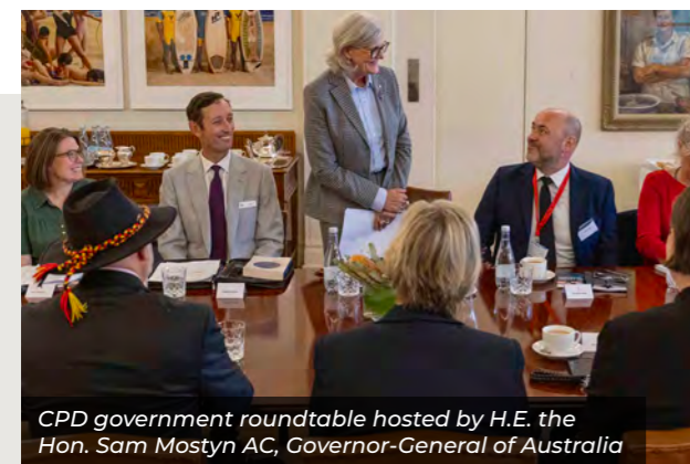
CPD government roundtable hosted by H.E. the Hon. Sam Mostyn AC, Governor-General of Australia